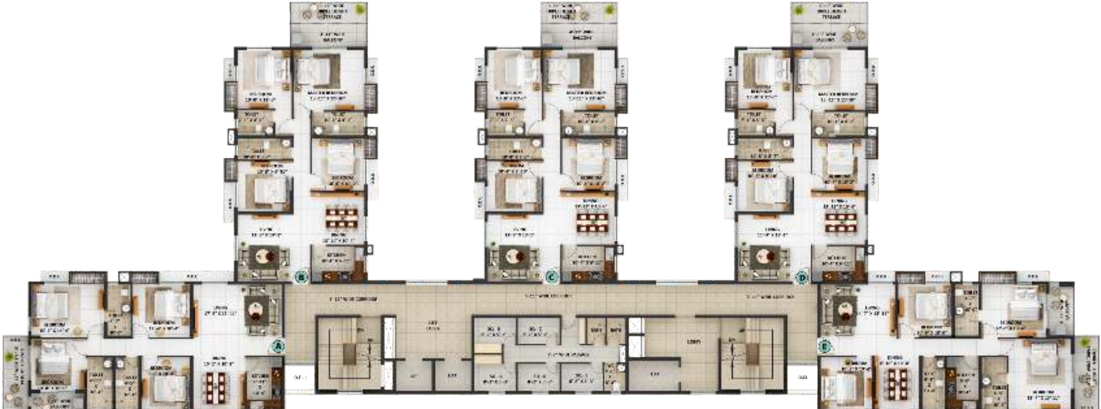
ALYA : 3rd, 6th, 9th, 12th, 15th, 18th Floor