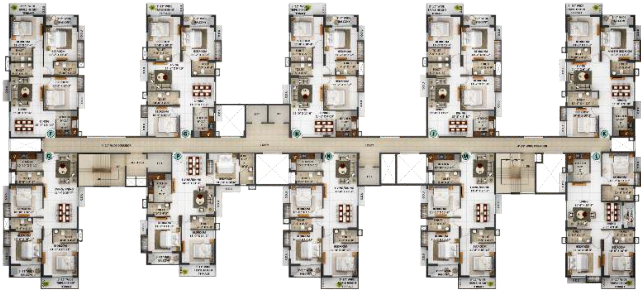
ANAHITA : 2nd, 5th, 8th, 11th, 14th, 17th, 20th Floor