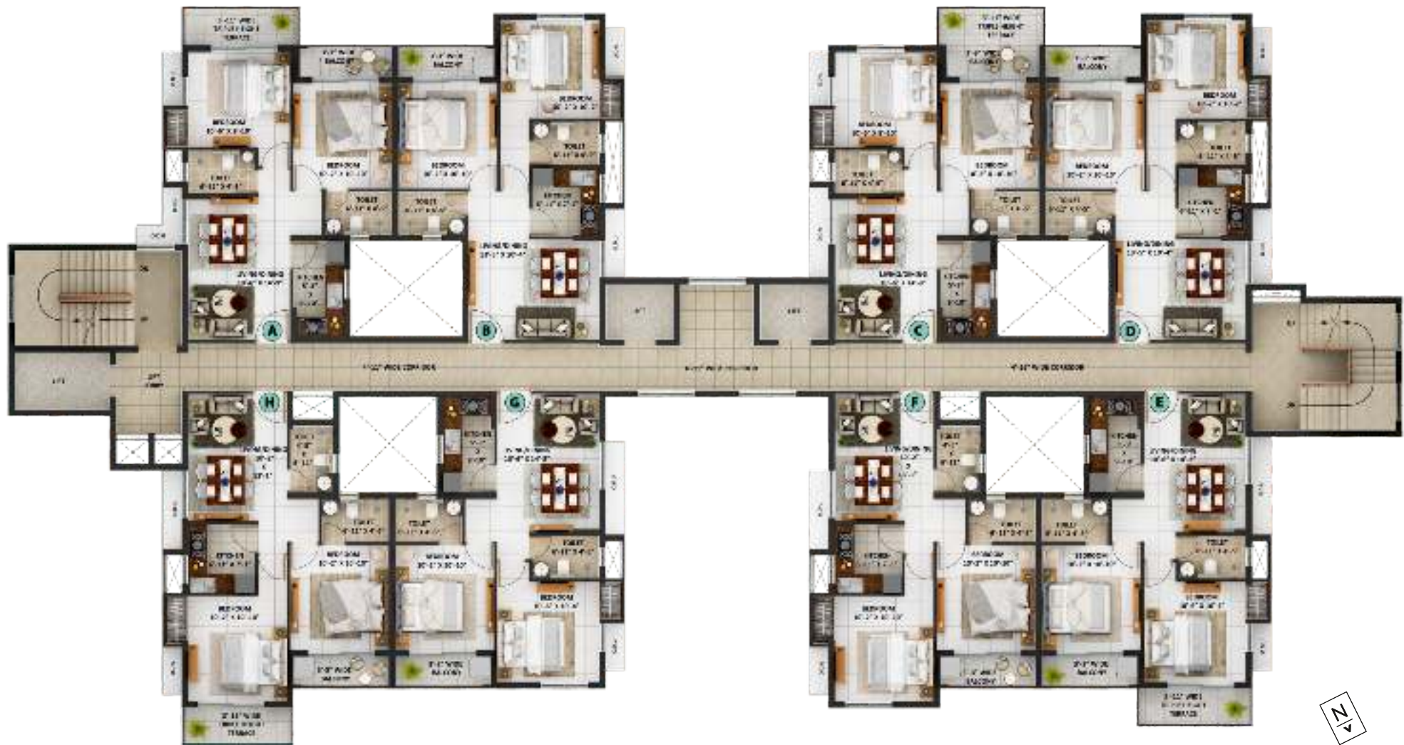
AVYA : 3rd, 6th, 9th, 12th, 15th, 18th Floor