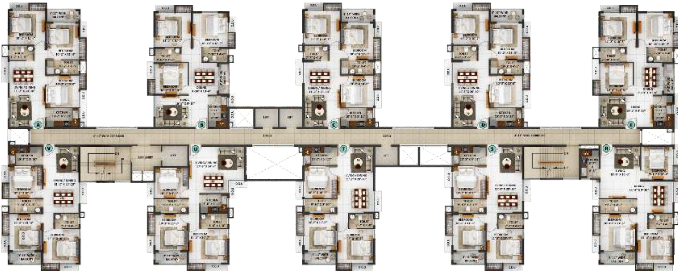
ANYA : 3rd, 6th, 9th, 12th, 15th, 18th Floor