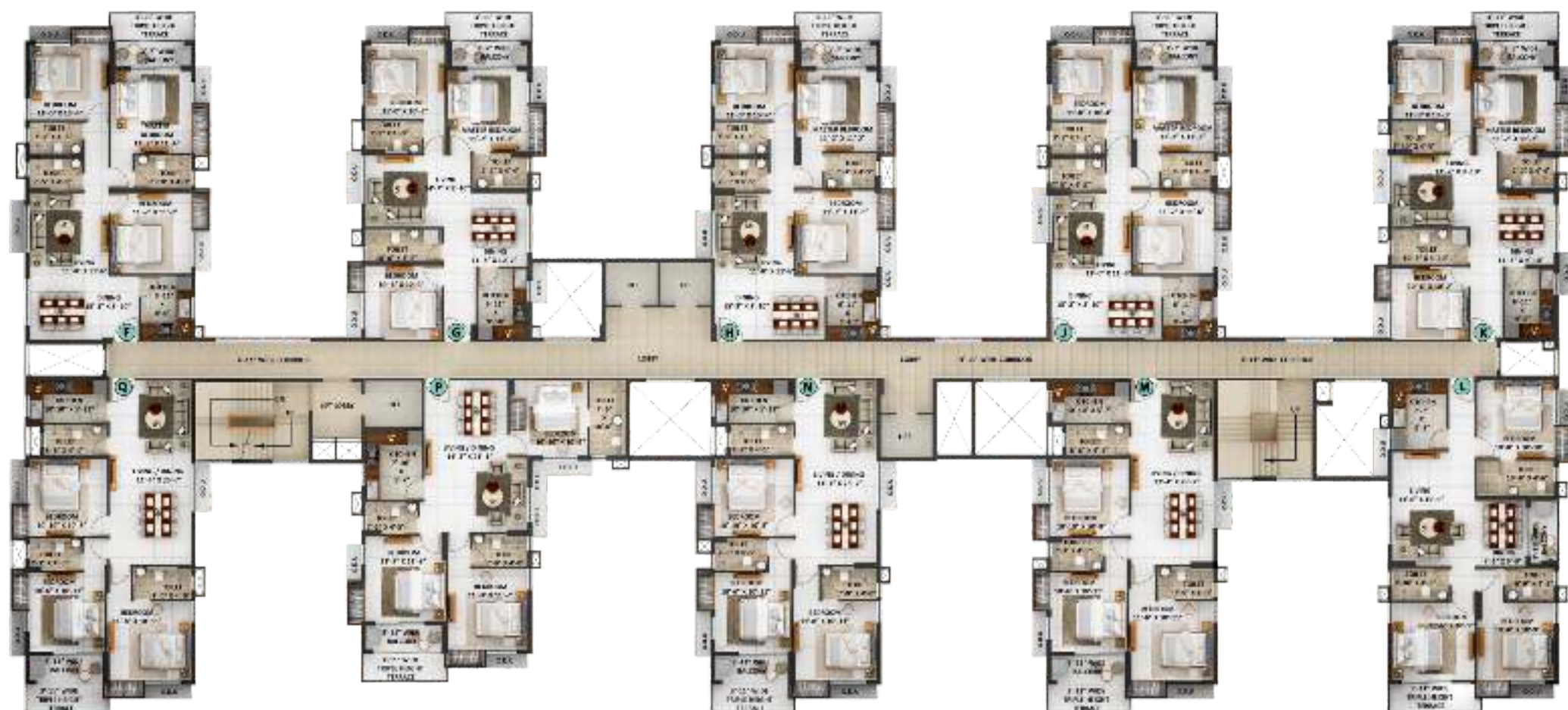
ANAHITA : 3rd, 6th, 9th, 12th, 15th, 18th Floor