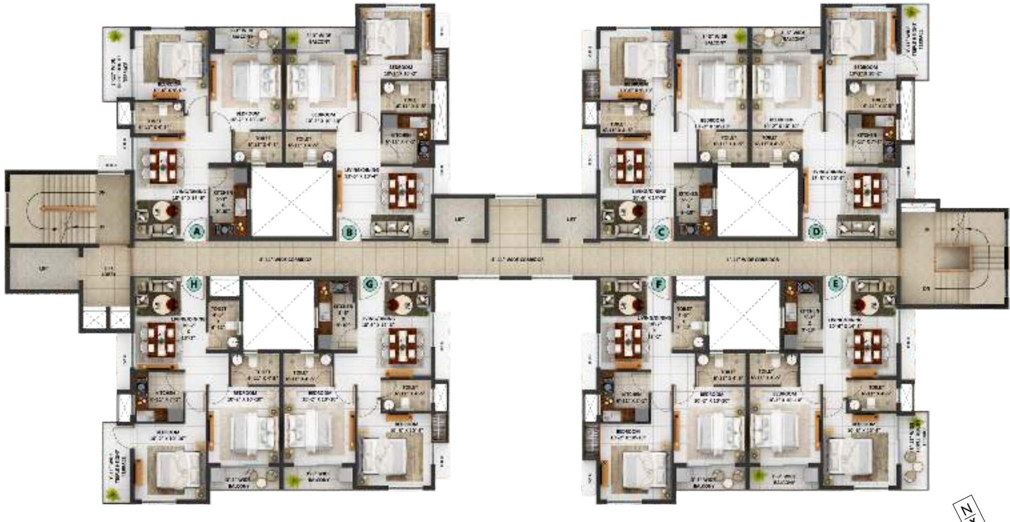
AVYA : 4th, 7th, 10th, 13th, 16th Floor