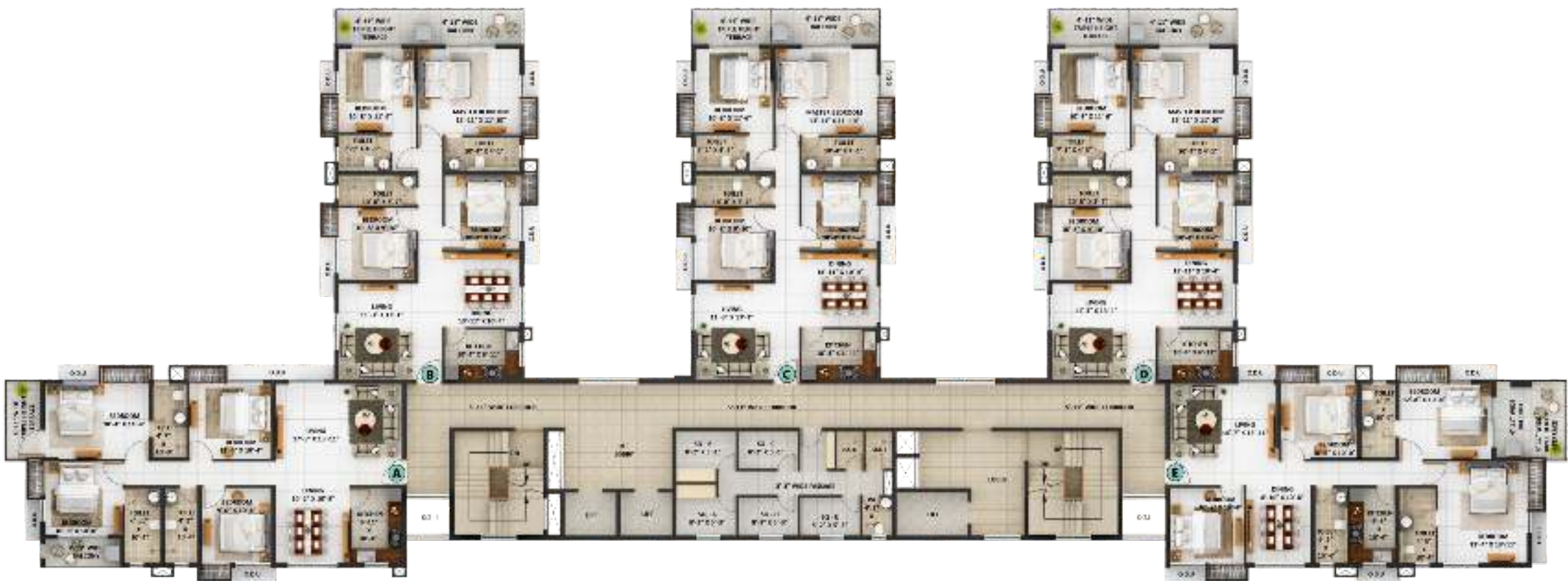
ALYA : 2nd, 5th, 8th, 11th, 14th, 17th, 20th Floor