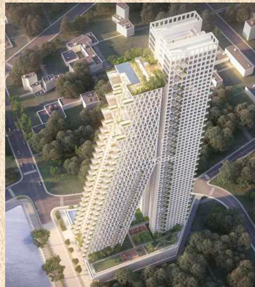
Altair | Colombo, Sri Lanka