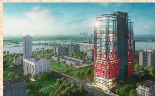
The Summit | Sector V, Kolkata