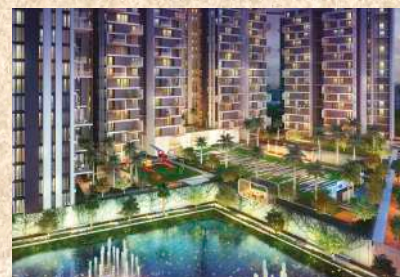
The One Tollygunge, Kolkata