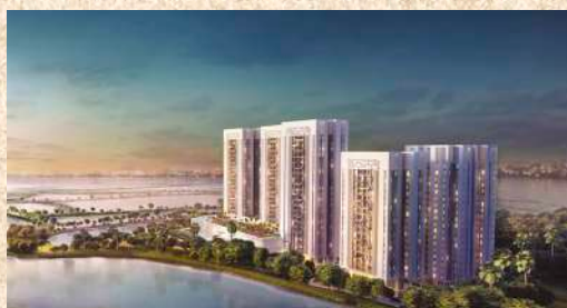
Fifth Avenue Sector V, Kolkata