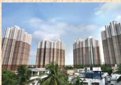
South City Residence Kolkata