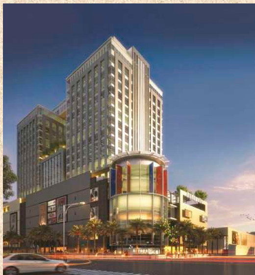
Acropolis Mall | Kolkata