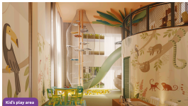
Kid's play area