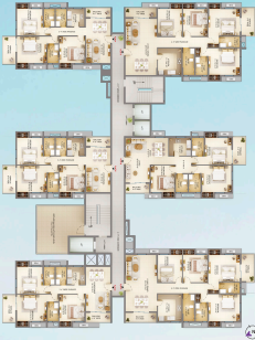
TOWER-2: 2nd Floor

TOWER-2: 2nd, 4th, 6th, 8th, 10th, 12th, 14th, 16th, 18th, 20th, 22nd, 24th, 26th & 28th