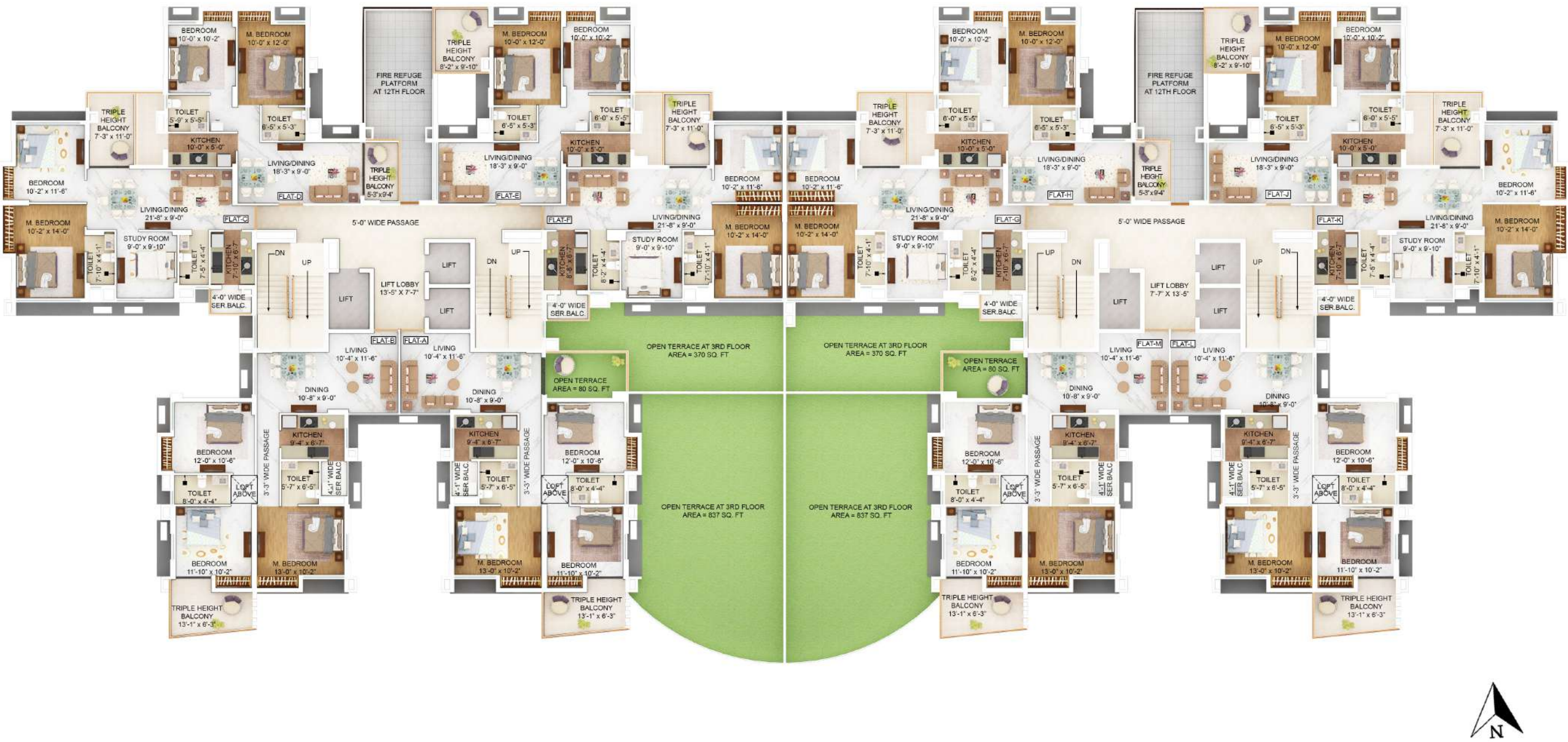
Tower 2 - 3rd Floor