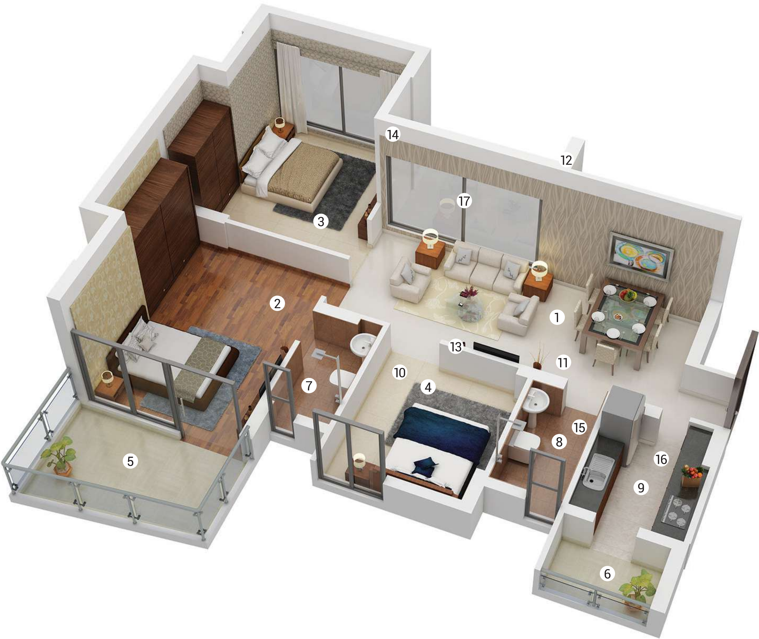
Tower 1 & 3 - 2, 5, 8, 11, 14 & 17 th floor (Type C) (Area as per WBHIRA)