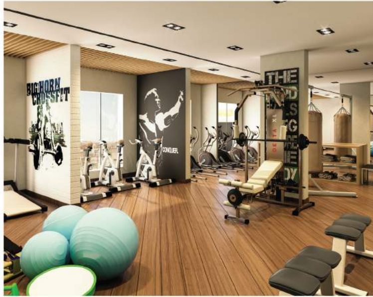
Well-equipped AC gymnasium