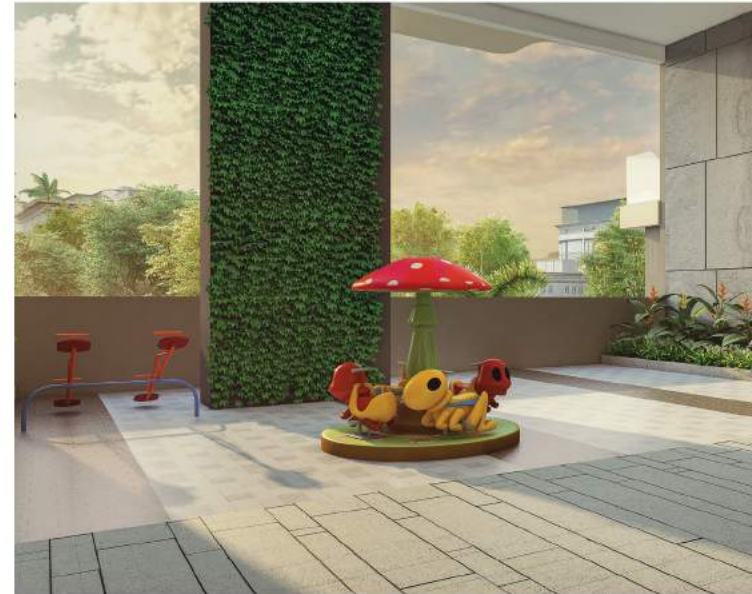
Kids' play area