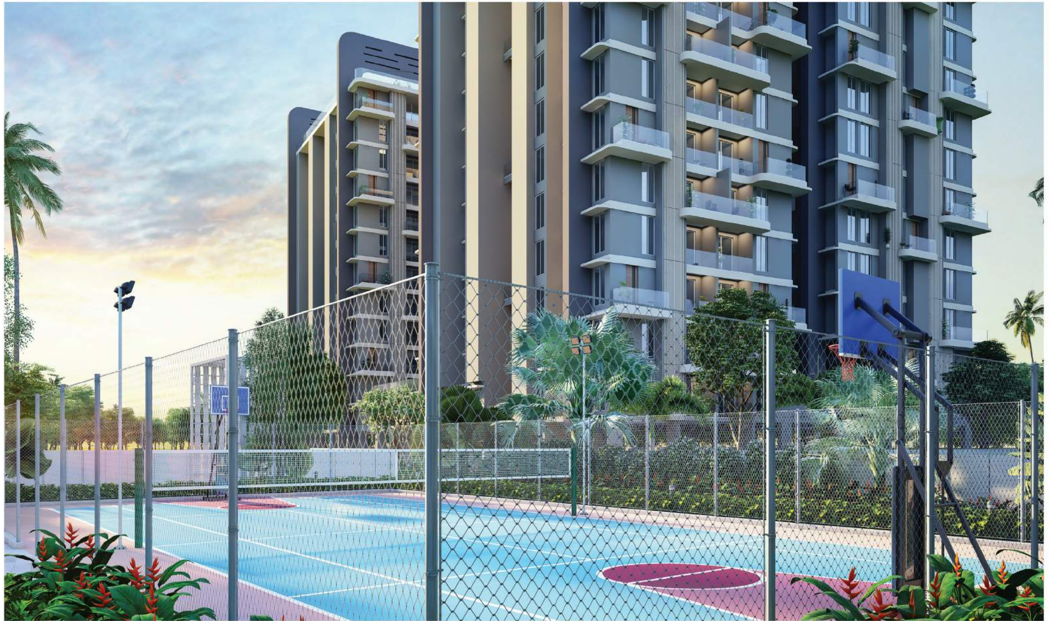
Multi-purpose sports arena