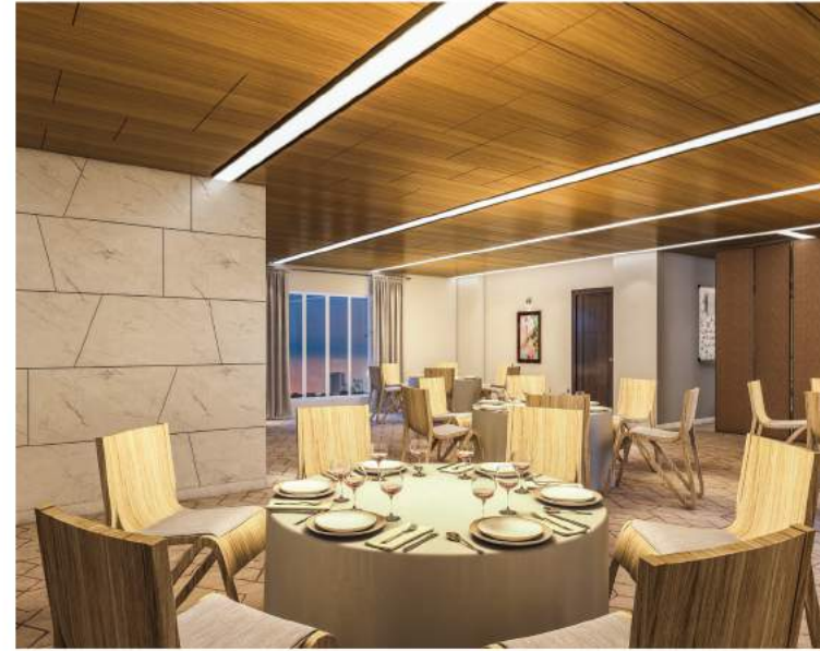
Sprawling banquet hall